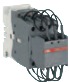
UA 30-30-10 RA