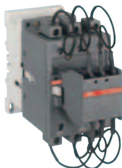
UA 75-30-00 RA